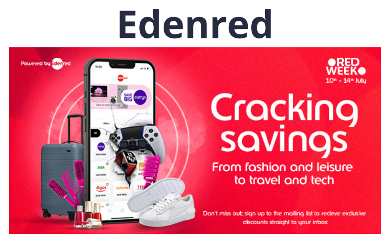
Red Week is just around the corner!

Starting July 4th , Edenred will be bringing you some cracking savings – from fashion and leisure to travel and tech, there's plenty of increased discounts to take advantage of. Plus keep an eye out for our exclusive competition to win a £400 voucher to put towards a lastminute.com holiday package.