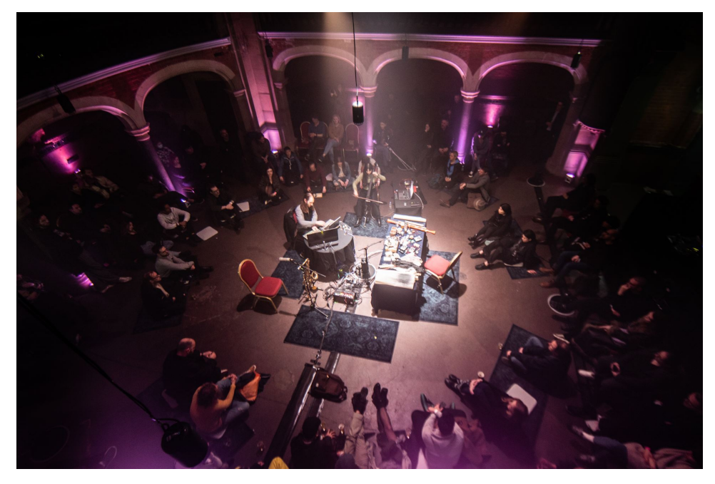
An Introduction to 4DSOUND