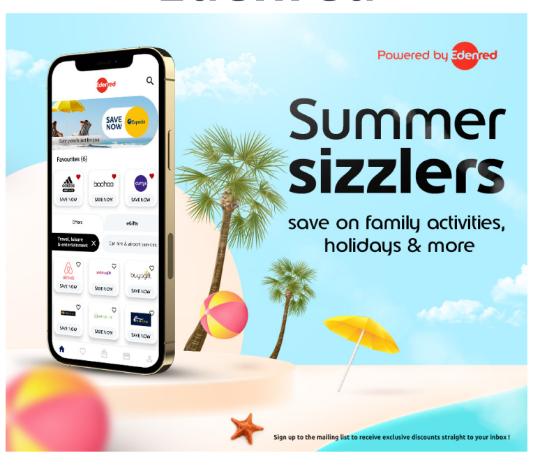
Enjoy sizzling savings this Summer!

It may not feel like it, but summer is around the corner! Now's the perfect time to take advantage of Edenred savings platform to save money over the summer – whether hosting friends and family at home, planning a staycation or a trip overseas, there's fantastic offers across a range of different categories helping your employees enjoy summer for less.