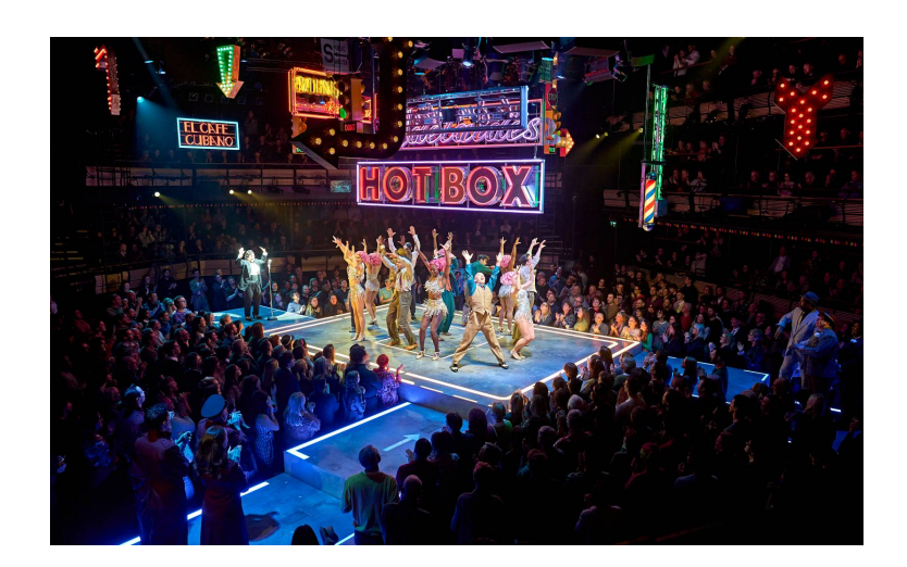
Walk and Talk: Guys and Dolls at the Bridge Theatre Monday 17th July 2pm - 4pm 7.30pm Show Watch Register here

Friday 7th July 1pm - 2pm Online Register <u>Here</u>