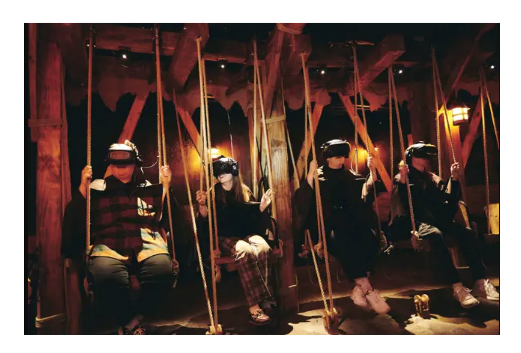
Walk and Talk :THE GUNPOWDER PLOT (Tower Hill, London) Show Control & System Design for Immersive Theatre

Monday 12th June 10.30am - 12.00pm GMT Register <u>here.</u> The Travel Assistance Scheme is available <u>here.</u>