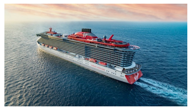
Sound for Cruises