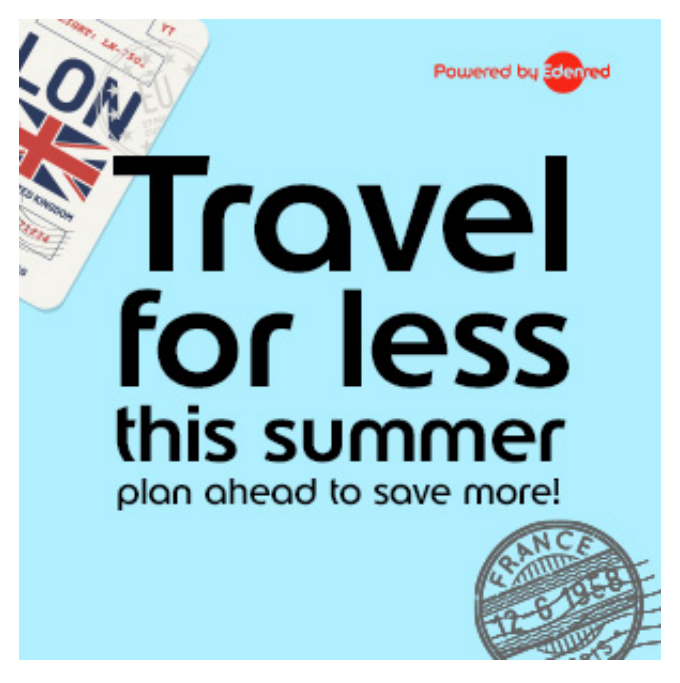
Pay less for your weekend trips and Summer holidays

With summer holidays on the horizon once again, now is the perfect time for your employees to take advantage of their savings platform to plan ahead and save more. From staycations and long weekends away to sunshine city breaks, there's a huge range of offers available to suit every taste and budget.