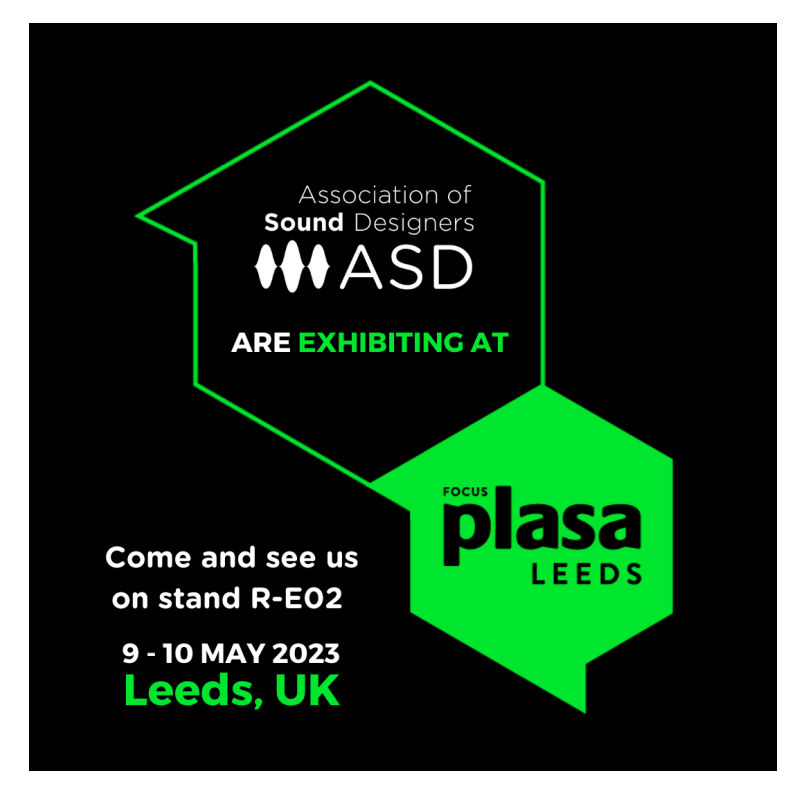
Use the unique link here to register