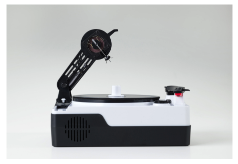
This is Colossal

We might be a little late to the party with this website, but it's a treasure trove of