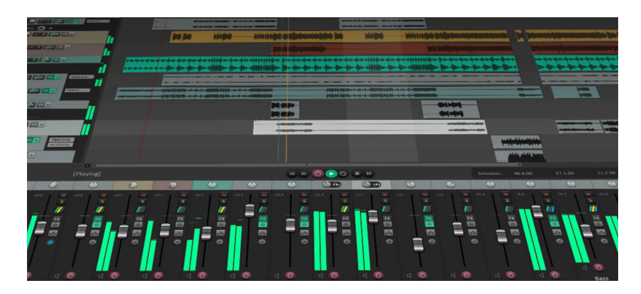
Whats New in Reaper 7

transform.engine runs VST3 plugins, giving engineers and creatives access to the very best studio-grade processing on a robust platform that is specifically designed for the complexities of live productions. Read more in this <u>LSi article</u> or check out the <u>Fourier Audio</u> website for more info.