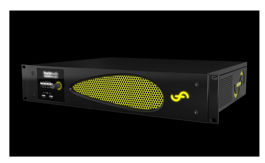
Fourier Audio has joined forces with DiGiCo releasing the transform.engine

transform.engine runs VST3 plugins, giving engineers and creatives access to the very best studio-grade processing on a robust platform that is specifically designed for the complexities of live productions. Read more in this <u>LSi article</u> or check out the <u>Fourier Audio</u> website for more info.