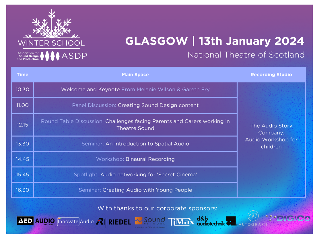
Limited places - Register for your place at Glasgow Winterschool here

Register your kids for The Audio Story Company workshop <u>here</u>. Children of all ages welcome.