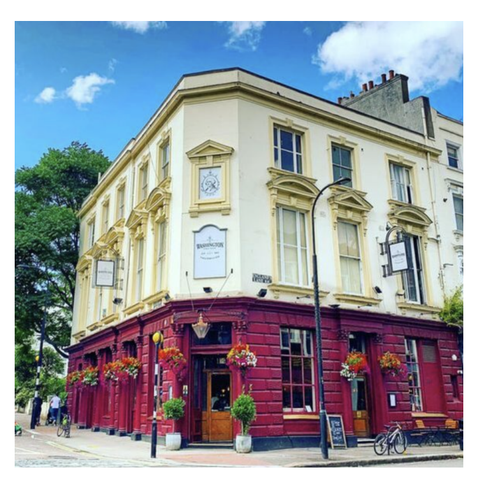
London Social The Washington

Thursday 11th January 6pm onwards 50 Englands Lane, London, Greater London, NW3 4UE (right near winterschool!) Let us know if you are coming <a href="here.">here.</a>