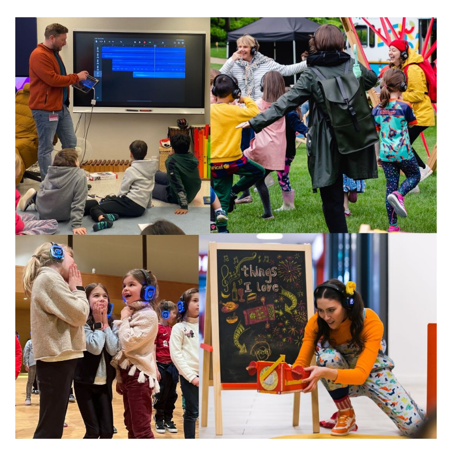
Register your kids for The Audio Story Company workshop <u>here</u>. Children of all ages welcome limited spaces available.

engineer, foley artist and voice actor in this interactive experience. We create supportive spaces for kids to discover how they can use their voice in interesting ways and create sound effects from everyday objects to craft their very own captivating audio stories. It's a hands-on adventure where your child's imagination takes centre stage, making memories and audio stories that will last a lifetime. Join us for a day of audio magic and watch your child's creativity come to life!